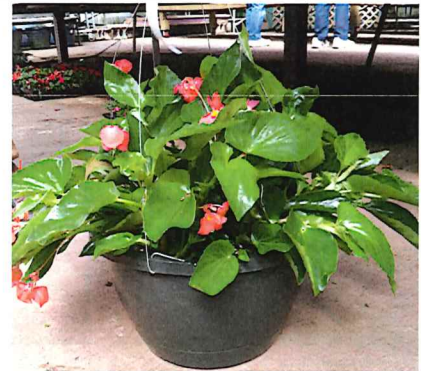
E) Hanging Basket – 12” Red Dragon Wing Begonias Sun or Shade Plant $35