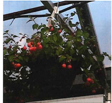
D) Hanging Basket – 10” Dark Pink & Purple Fuscias Shade Plant $30