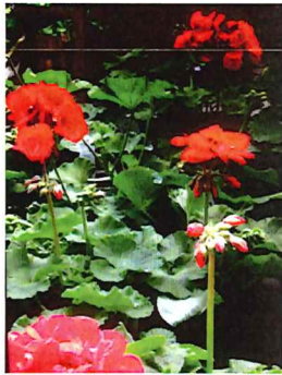
B) Potted – 10” Pink Geraniums Sun Plant $25