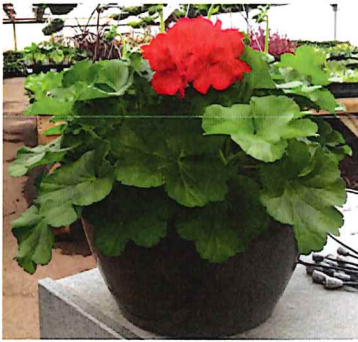
A) Hanging Basket – 12” Red Geraniums Sun Plant $35