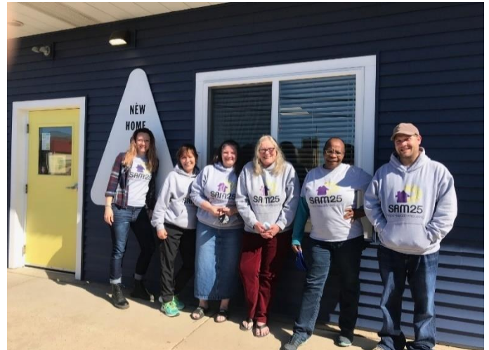
Pictured above: SAM25 Staff on the last day of shelter season 2021.