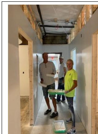
Pictured left: Volunteers painting the soon-to-be completed SAM25 Community Health Clinic and below SAM25's new asphalted parking lot by Wolf River Asphalt (made possible by a grant through the WHEDA Foundation!)